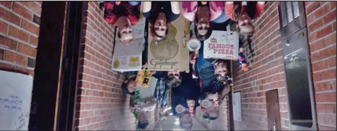
Students ready and aiming (haha ... so punny) for a spot in the Final Four of the Nerf Bracket.